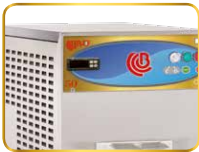
Thermo-regulator by display