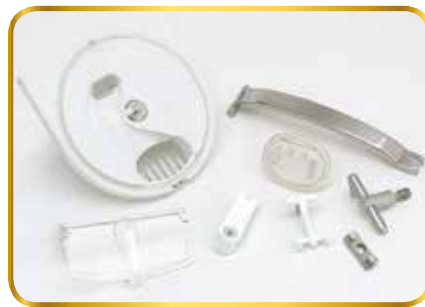
Complementary door is disassembled without the use of tools, for a perfect hygiene