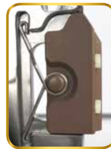
Interchangeable metal scrapers