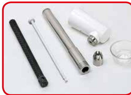
Removable components of the dispensing nozzle for perfect cleaning