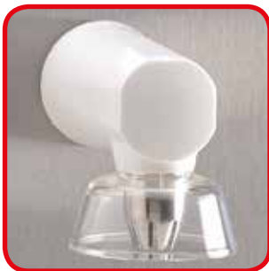
Stainless steel spout