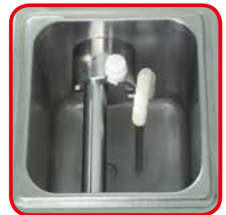
Directly refrigerated tank