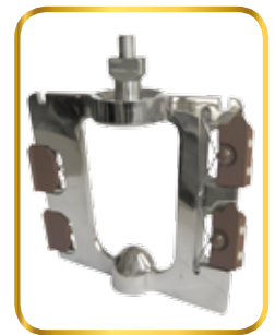
Two blade mixer